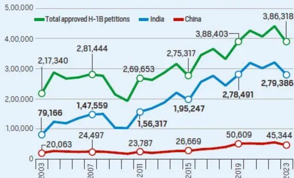
CHART 1: NUMBER OF H-1B PETITIONS APPROVED BY USCIS (2003-23)