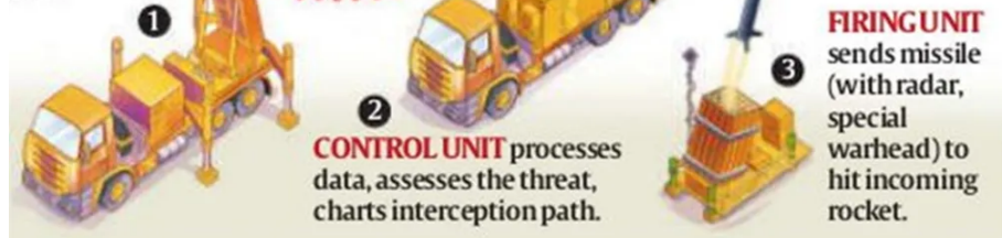
Illustration: Suvajit Dey; Photos: Reuters, Rafael Advanced Defence Systems; Information: AP, Rafael, CSIS

detects airborne rocket/shell, transmits data to the control unit.