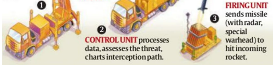
Illustration: Suvajit Dey; Photos: Reuters, Rafael Advanced Defence Systems; Information: AP, Rafael, CSIS

detects airborne rocket/shell, transmits data to the control unit.