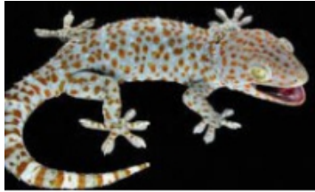
world. Tokay gecko