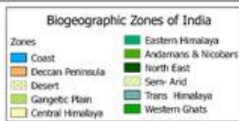
SKINK SPECIES DISTRIBUTION IN DIFFERENT BIOGEOGRAPHIC ZONES OF INDIA (ENDEMIC SPECIES IN BRACKETS)