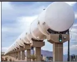
In December 2017, Hyperloop One's pod reached a top speed of over 385 kmph on its test track in the Nevada desert, north of Las Vegas. The targeted speed is 1,223 kmph

The hyperloop train in its current version was conceptualized by billionaire inventor Elon Musk, who publicized it in 2012, open-sourced it and encouraged others to take the ideas and develop them. Hyperloop One, now called Virgin Hyperloop One, which has entered into an agreement with Maharashtra, is a private company founded in 2014 with the aim of placing hyperloop trains around the world by 2021