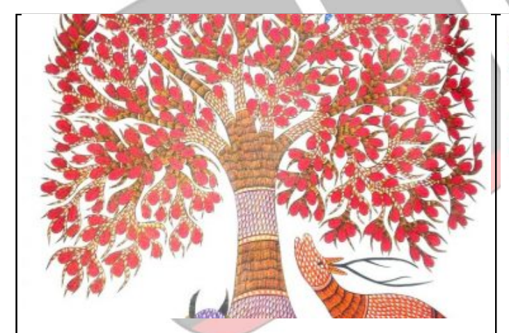
Gond painting of Dindori