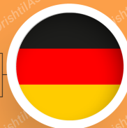
Weimar Constitution of Germany