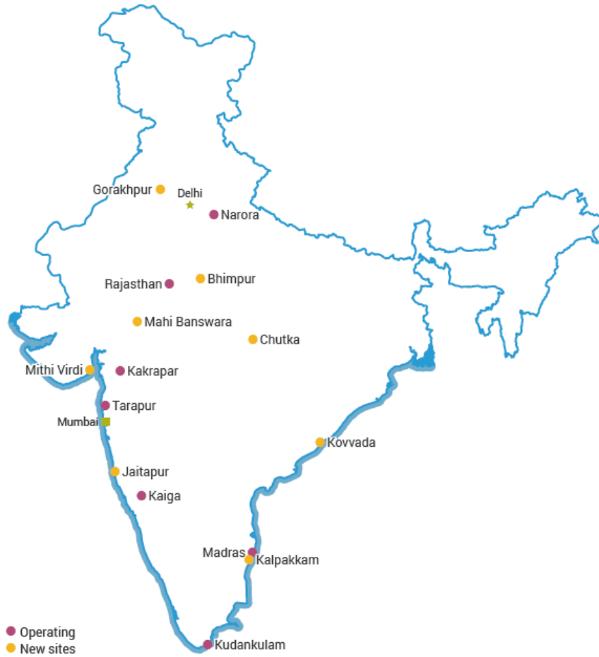
Planned Nuclear Power Plants in India