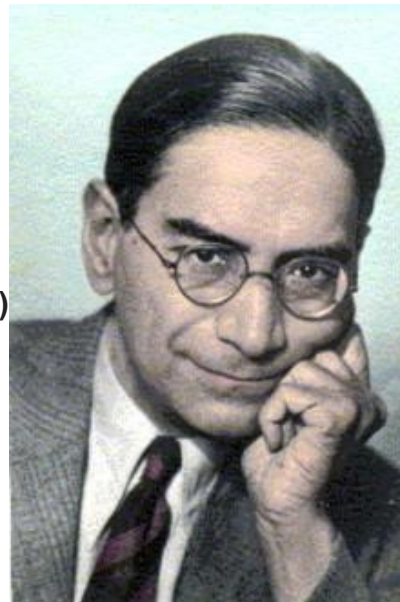
Prof. Prasanta Chandra Mahalanobis (1893-1972)