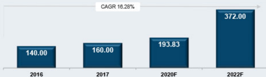
Healthcare Sector Growth Trend (US$ billion)