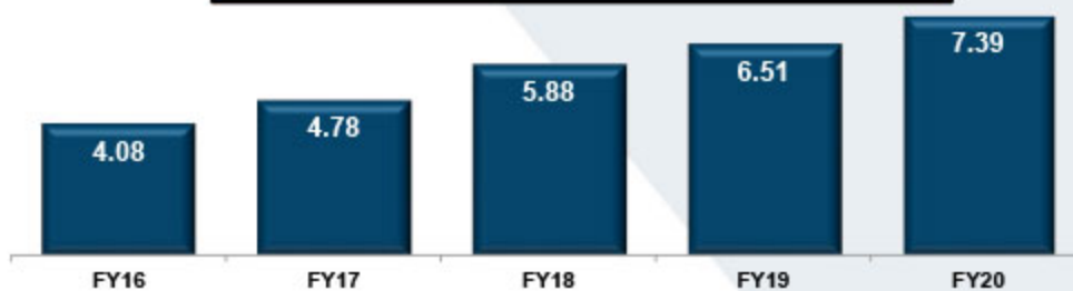
Health Insurance Premium Collection (US$ billion)