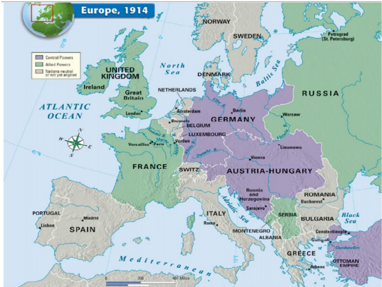
Fig: Alliances at the beginning of the War