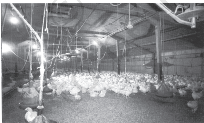
Fig. 6.4 Poultry has the largest share of total livestock in India

However problems related to over- fishing and