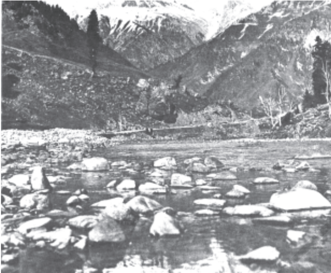
Fig. 9.1 Water bodies: small, snow-fed Himalayan streams are the few fresh-water sources that remain unpolluted.

this results in an environmental crisis. This is the situation today all over the world. The rising population of the developing countries and the affluent consumption and production standards of the developed world have placed a huge stress on the environment in terms of its first two functions. Many resources have become extinct and the wastes generated are beyond the absorptive capacity of the environment. Absorptive capacity means the ability of the environment to