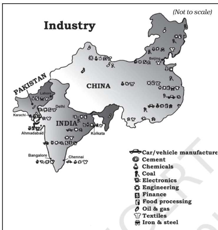
Fig. 10.3 Industry in India, China and Pakistan

and China's growth rates, whereas, India met with moderate increase in growth rates. Some scholars hold the reform processes introduced in Pakistan and political instability over a long period as reasons behind the declining growth rate in Pakistan. We will study in a later section which sector contributed to different growth rates in these countries.