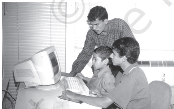
Fig. 5.4 Job on hand: transforming India into a knowledge economy

workforce, particularly involving mathematics, computer science, and data science, in conjunction with multidisciplinary abilities across the sciences and social sciences, and humanities, will be increasingly in greater demand. With climate change, increasing pollution, and depleting natural resources, there will be a sizeable shift in how we meet the world's energy, water, food, and sanitation needs, again resulting in the need for new skilled labour, particularly in biology, chemistry, physics, agriculture, climate science, and social science. The growing emergence of epidemics and pandemics will also call for collaborative research in infectious disease management and development of vaccines and the resultant social issues heightens the need for multidisciplinary learning. There will be a growing demand for humanities and art, as India moves towards becoming a developed country as well as