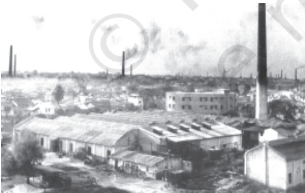
Fig. 9.2 Damodar Valley is one of India's most industrialised regions. Pollutants from the heavy industries along the banks of the Damodar river are converting it into an ecological disaster

But with population explosion and with the advent of industrial revolution to meet the growing needs of the expanding population, things changed. The result was that the demand for resources for both production and consumption went beyond the rate of regeneration of the resources; the pressure on the absorptive capacity of the environment increased tremendously — this trend continues even today. Thus what has happened is a reversal of supply-demand relationship for environmental quality — we are now faced with increased demand for environmental resources and services but their supply is limited due to overuse