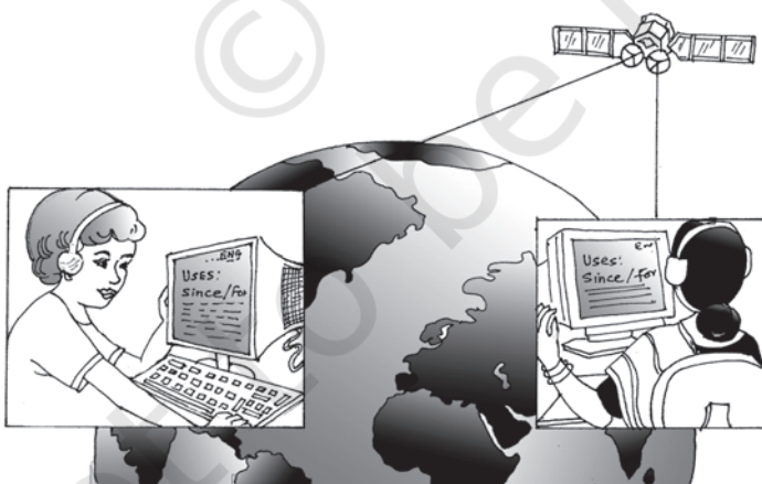
Fig. 3.1 Outsourcing: a new employment opportunity in big cities

global trade organisation to administer all multilateral trade agreements by providing equal opportunities to all countries in the international market for trading purposes. WTO is expected to establish a rule-based trading regime in which nations cannot place arbitrary restrictions on trade. In addition, its purpose is also to enlarge