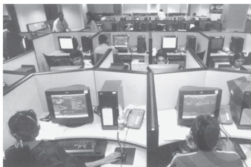
Fig. 3.2 IT industry is seen as a major contributor to India's exports

Some scholars question the usefulness of India being a member of the WTO as a major volume of international trade occurs among the developed nations. They also say that while developed countries file complaints over agricultural subsidies given in their countries, developing countries feel cheated as they are forced to open their markets for developed countries but are not allowed access to the markets of developed countries. What do you think?