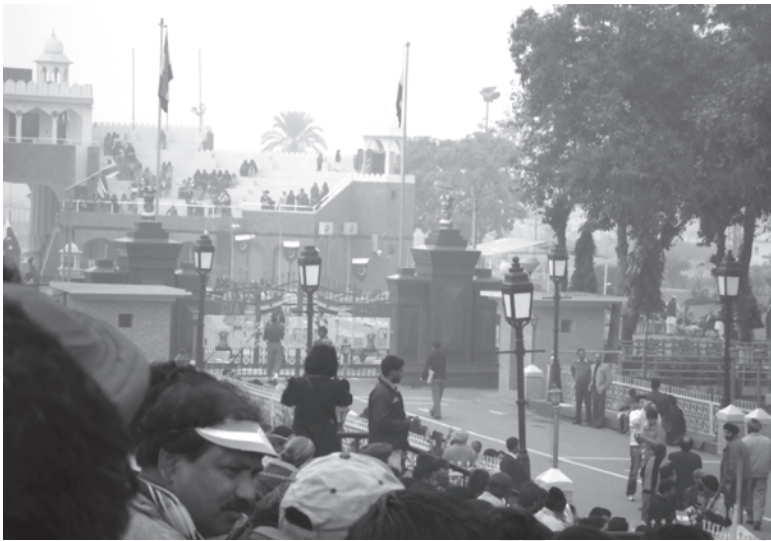
Fig. 10.1 Wagah Border is not only a tourist place but also used for trade between India and Pakistan

goods. At this stage, enterprises owned by government (known as State Owned Enterprises—SOEs), which we, in India, call public sector enterprises, were made to face competition. The reform process also involved dual pricing. This means fixing the prices in two ways; farmers and industrial units were required to buy and sell fixed quantities of inputs and outputs on the basis of prices fixed by the government and the rest were purchased and sold at market prices. Over the years, as production increased, the proportion of goods or inputs transacted in the market also increased. In order to attract foreign investors, special economic zones were set up.