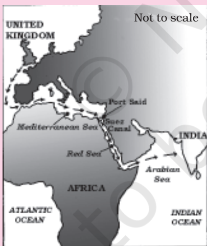
Fig.1.2 Suez Canal: Used as highway between India and Britain

Various details about the population of British India were first collected through a census in 1881. Though suffering from certain limitations, it revealed the unevenness in India's population growth. Subsequently,