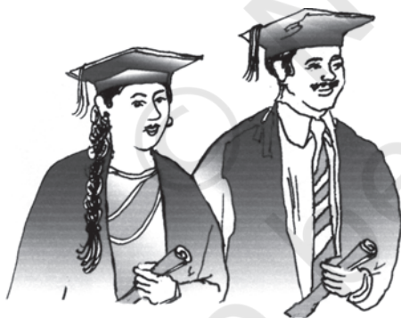
Fig. 5.7 Higher Education: few takers

The differences in literacy rates between males and females are narrowing signifying a positive development in gender equity; still the need to promote education for women in India is imminent for various reasons such as improving economic independence and social status of women and also because women education makes a favourable impact on fertility rate and health care of women and children. Therefore, we cannot be complacent about the upward movement in the literacy rates and we have miles to go in achieving cent per cent adult literacy.