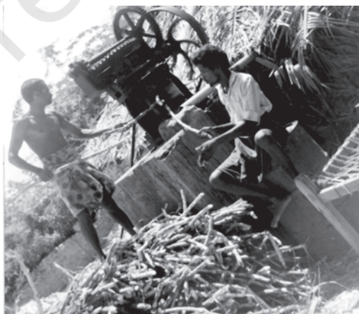
Fig. 6.2 Jaggery making is an allied activity of the farming sector

greater risk in depending exclusively on farming for livelihood. Diversification towards new areas is necessary not only to reduce the risk from agriculture sector but also to provide productive sustainable livelihood options to rural people. Much of the agricultural employment activities are concentrated in the Kharif season. But during the Rabi season, in areas where there are inadequate irrigation facilities, it becomes difficult to find gainful employment. Therefore expansion into other sectors is essential to provide supplementary gainful employment and in realising higher levels of income for rural people to overcome poverty and other tribulations. Hence, there is a need to focus on allied activities, non-farm employment and other emerging alternatives of livelihood, though there are many other options available for providing sustainable livelihoods in rural areas.