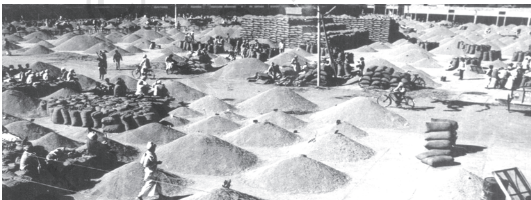
Fig. 6.1 Regulated market yards benefit farmers as well as consumers

Let us discuss four such measures that were initiated to improve the marketing aspect. The first step was regulation of markets to create orderly and transparent marketing conditions. By and large, this policy benefited farmers as well as consumers. However, there is still a need to develop about 27,000 rural periodic markets as regulated market places to realise the full potential of rural markets. Second component is provision of physical infrastructure facilities like roads, railways, warehouses, godowns, cold storages and processing units. The current infrastructure facilities are quite inadequate to meet the growing demand and need to be improved. Cooperative