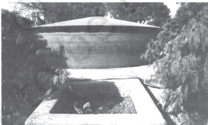
Fig.9.4 Gobar Gas Plant uses cattle dung to produce energy

Wind Power: In areas where speed of wind is usually high, wind mills can provide electricity without any adverse impact on the environment. Wind turbines move with the wind and electricity is generated. No doubt, the initial cost is high. But the benefits are such that the high cost gets easily absorbed.