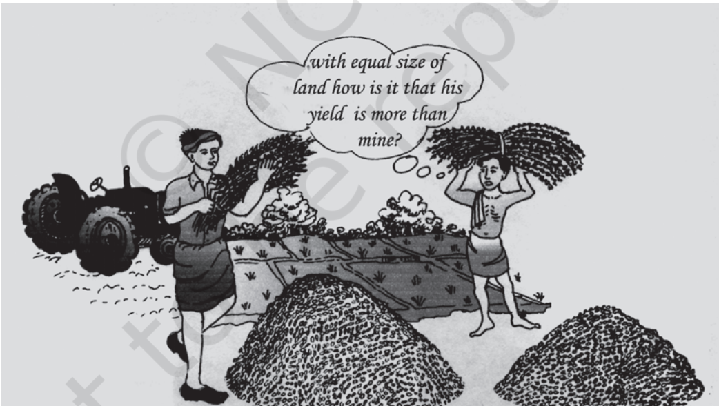
Fig. 5.1 Adequate education and training to farmers can raise productivity in farms

Education is sought not only as it confers higher earning capacity on people but also for its other highly valued benefits: it gives one a better social standing and pride; it enables one to make better choices in life; it provides knowledge to understand the changes taking place in society; it also stimulates innovations. Moreover, the availability of educated labour force facilitates adaptation of new