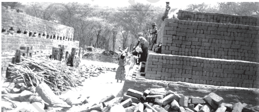
Fig. 5.6 School dropouts give way to child labour: a loss to human capital

Dream: Though literacy rates for both — adults as well as youth — have increased, still the absolute number of illiterates in India is as much as India's population was at the time of independence. In 1950, when the Constitution of India was passed by the Constituent Assembly, it was noted in the Directive Principles of the