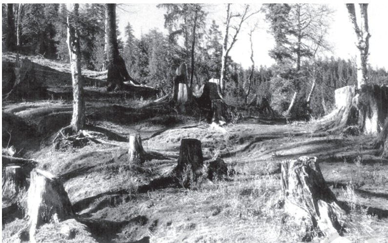
Fig. 9.3 Deforestation leads to land degradation, biodiversity loss and air pollution

India has abundant natural resources in terms of rich quality of soil, hundreds of rivers and tributaries, lush green forests, plenty of mineral deposits beneath the land surface, vast stretch of the Indian Ocean, ranges of mountains, etc. The black soil of the Deccan Plateau is particularly suitable for cultivation of cotton, leading to concentration of textile industries in this region. The Indo-Gangetic plains — spread from the Arabian Sea to the Bay of Bengal — are one of the most fertile, intensively cultivated and densely populated regions in the world. India's forests, though unevenly distributed, provide green cover for a majority of its population and natural cover for its wildlife. Large deposits of iron-ore, coal and natural gas are found in the country. India accounts for nearly 8 per cent of the world's total iron-ore reserves. Bauxite, copper, chromate, diamonds, gold, lead, lignite, manganese, zinc, uranium, etc. are also available in different parts of the country. However, the developmental activities in India have resulted in