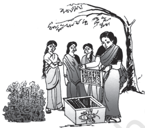
Fig. 6.5 Women in rural households take up bee-keeping as an entrepreneurial activity

Horticulture: Blessed with a varying climate and soil conditions, India has adopted growing of diverse horticultural crops such as fruits, vegetables, tuber crops, flowers, medicinal and aromatic plants, spices and plantation crops. These crops play a vital role in providing food and nutrition, besides addressing employment concerns. Horticulture sector contributes nearly one-third of the value of agriculture output and six per cent of Gross Domestic Product of India. India has emerged as a world leader in producing a variety of fruits like mangoes, bananas, coconuts, cashew nuts and a number of spices and is the second largest producer of fruits and vegetables. Economic condition of many farmers engaged in horticulture has improved and it has become a means of improving livelihood for many unprivileged classes. Flower