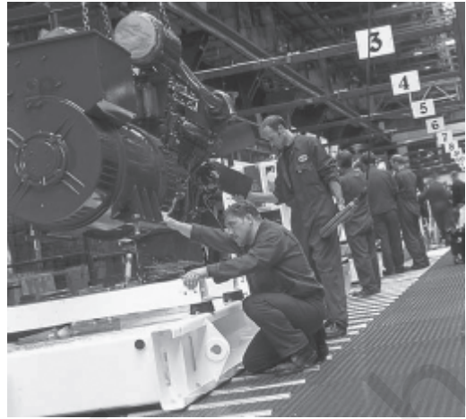
Fig. 5.3 Scientific and technical manpower: a rich ingredient of human capital

Empirical evidence to prove that increase in human capital causes economic growth is rather nebulous. This may be because of measurement problems. For example, education measured in terms of years of schooling, teacher-pupil ratio and enrolment rates may not reflect the quality of education; health services measured in monetary terms, life expectancy and mortality rates may not reflect the true health status of the people in a country. Using the indicators mentioned above, an analysis of improvement in education and health sectors and growth in real per capita income in both developing and developed countries shows that there is convergence in the measures of human capital but no sign of convergence of per capita real income. In other words, the human capital growth in developing countries has been faster but the growth of per capita real income has not been that fast. There are reasons to believe that the