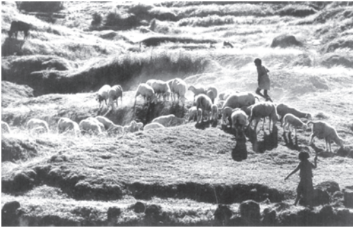
Fig. 6.3 Sheep rearing — an important income augmenting activity in rural areas

followed by others. Other animals which include camels, asses, horses, ponies and mules are in the lowest rung. India had about 303 million cattle, including 110 million buffaloes in 2019. Performance of the Indian dairy sector over the last three decades has been quite impressive. Milk production in the country has increased by about ten times between 1951-2016. This can be attributed mainly to the successful implementation of 'Operation Flood'. It is a system whereby all the farmers can pool their milk produced according to different grading (based on quality), processed and marketed to urban centres through cooperatives. In this system the farmers are assured of a fair price and income from the supply of milk to urban markets. As pointed out earlier Gujarat state is held as a success story in the efficient implementation of milk cooperatives which has been emulated by many states. Gujarat, Madhya Pradesh, Uttar Pradesh, Andhra Pradesh, Maharashtra, Punjab and Rajasthan, are major milk producing states. Meat,