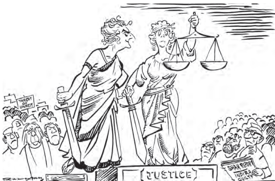
Mrs. Gandhi's confrontation with the Shah Commission provoked this cartoon when the commission's report was released.

Addressing the nation on All India Radio on 26 June 1975