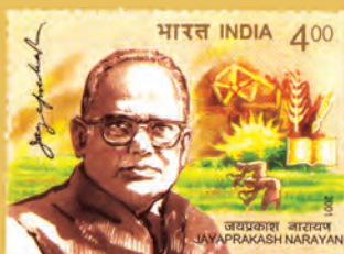
Loknayak Jayaprakash Narayan (JP) (1902-1979): A marxist in his youth; founder general secretary of the Congress Socialist

Party and the Socialist Party; a hero of the 1942 Quit India movement; declined to join Nehru's cabinet; after 1955 quit active politics; became a Gandhian and was involved in the Bhoodan movement, negotiations with the Naga rebels, peace initiative in Kashmir and ensured the surrender of decoits in Chambal; leader of Bihar movement, he became the symbol of opposition to Emergency and was the moving force behind the formation of Janata Party.