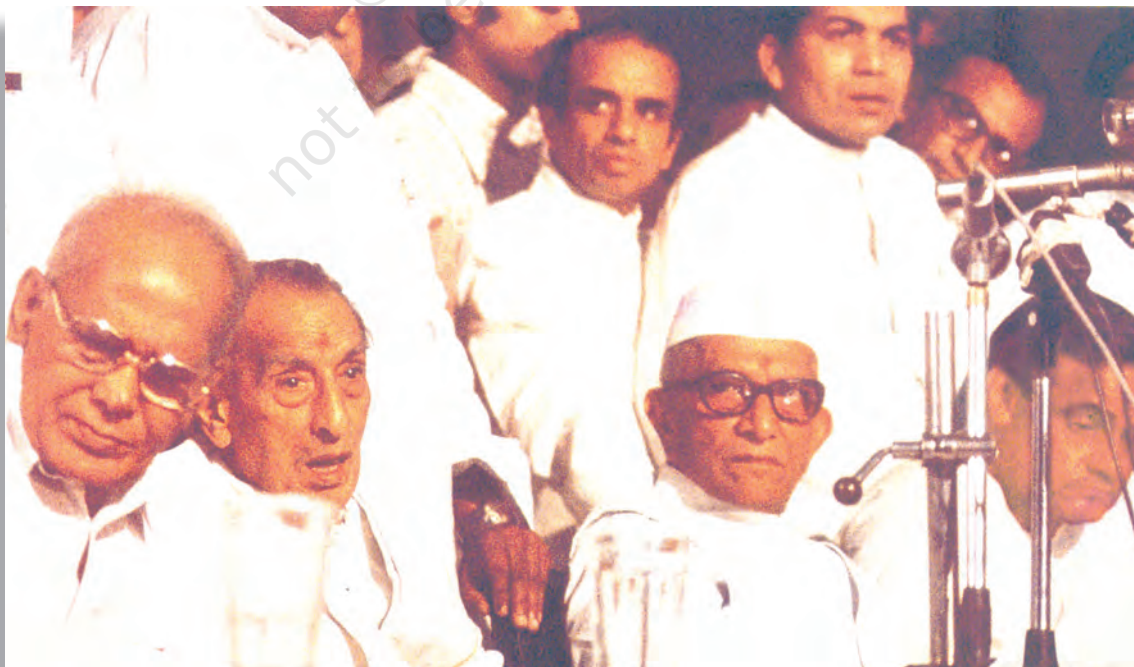
Oath taking by the first non-congress government at the centre in 1977. In the picture are Jayaprakash Narayan, J. B. Kriplani, Morarji Desai and Atal Behari Vajpayee.

The Janata Party government that came to power after the 1977 elections was far from cohesive. After the election, there was stiff competition among three leaders for the post of Prime Minister – Morarji Desai, who