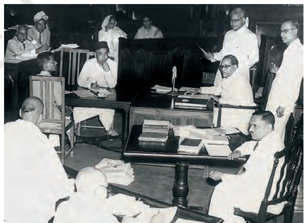
Dr. B.R. Ambedkar presiding over a discussion in the Constituent Assembly

Dr. B.R. Ambedkar CAD, Vol. VII, p.37, 4 November 1948