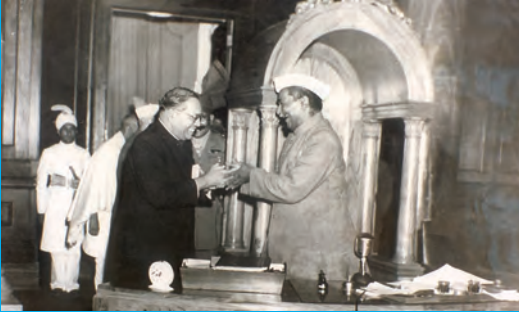
The President of the Constituent Assembly, Dr. Rajendra Prasad and the Chairman of the Drafting Committee, Dr. B.R. Ambedkar greeting each other

Constituent Assembly, where each clause of the Constitution was subjected to scrutiny and debate, is a tribute to public reason at its best. These debates deserved to be memorialised as one of the most significant chapters in the history of constitution making, equal in importance to the French and American revolutions.