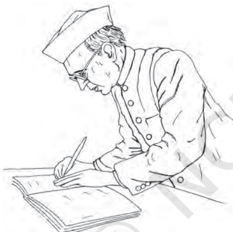
Jawaharlal Nehru CAD, Vol. VI, p. 734

We have already seen that President is the formal head of the government. In this formal sense, the President has wide ranging executive, legislative, judicial and emergency powers. In a parliamentary system, these powers are in reality used by the President only on the advice of the Council of Ministers. The Prime Minister and the Council of Ministers have support of the majority in the Lok Sabha and they are the real executive. In most of the cases, the President has to follow the advice of the Council of Ministers.