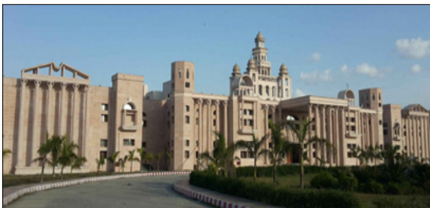
Uttarakhand Technological University