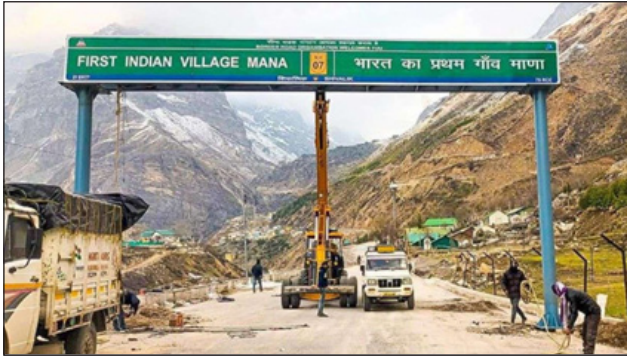
Mana village - now