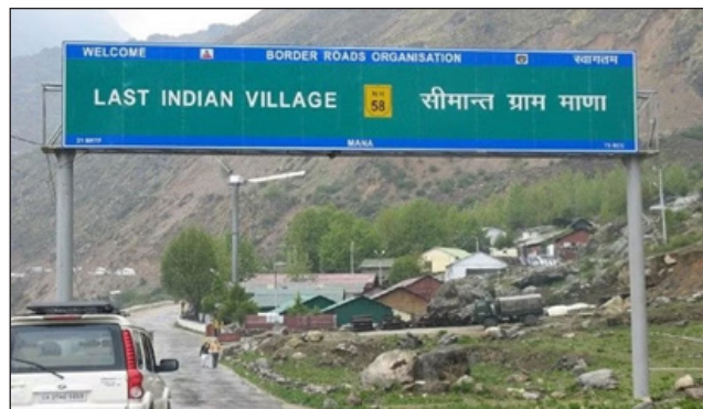
Mana village - First